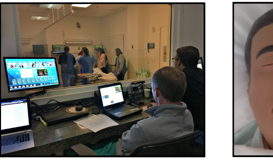
Figure 1. Left: Simulation center setup where a team of medical learners treat a non-expressive RPS that is controlled by a medical simulation operator sitting in the operating room. Center: An example of a commonly used inexpressive mannequin head. Right: An example of an expressive RPS system our team built, that our team built which is synthesizing pain.